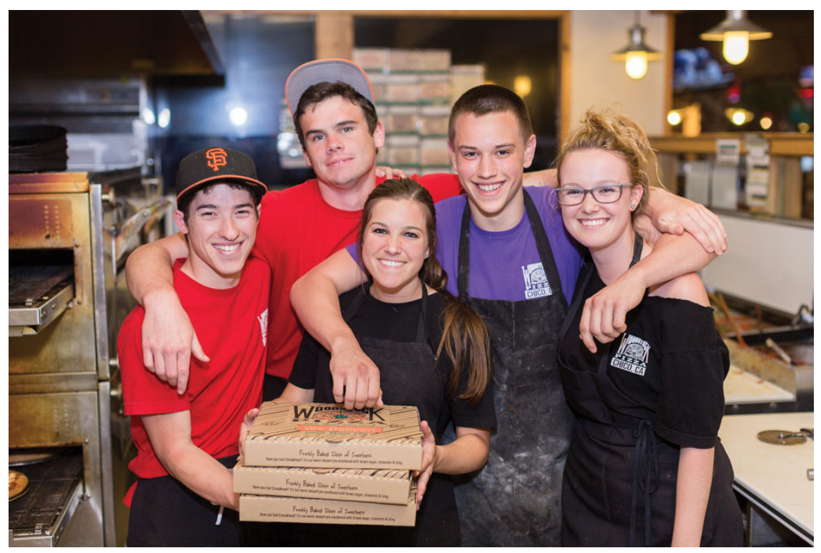
Woodstock's has a "continuous pipeline of new pizza and side ideas," thanks to its creative and engaged employees.

PMQ: With these new ingredients and crusts, will you be adding new signature pizzas to your menu?