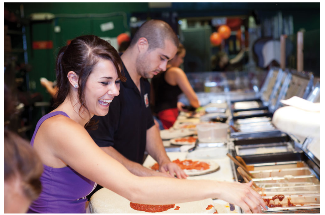
Woodstock's food prices went up after it switched to more nitrate-free and organic ingredients, but higher prices haven't hurt its sales.

Ambrose: Our costs have definitely gone up as we strive to offer higher-quality, premium ingredients, especially since we decided we would not change the amount of toppings on our pizzas in an effort to control costs. We are one of the highest-priced pizza restaurants in our towns, and that comes with some anxiety, but so far we've found that it hasn't hurt our sales at all.